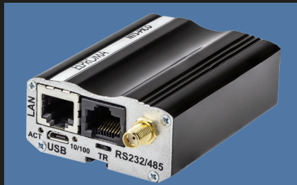
1) NTS-pico3 (DIN-rail mount)