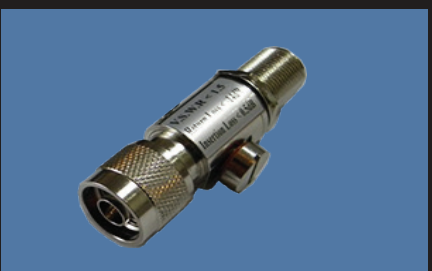
4) Accessories - GPS Surge Arrester