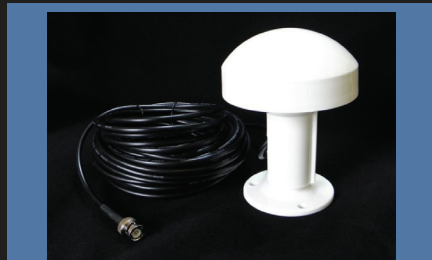
2) Accessories - Antenna 38db (30m)