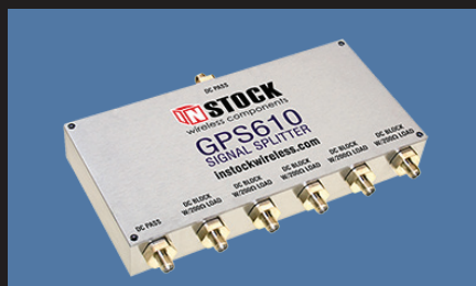
3) Accessories - GPS Signal Splitter 1 to 6